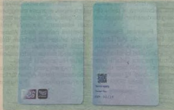
Kad TnG baharu dengan teknologi NFC membolehkan pengguna melakukan tambah nilai secara dalam talian.

PUTRAJAYA - Kementerian Perdagangan Dalam Negeri dan Hal Ehwal Pengguna (KPDNHEP) mengesan seorang pekerja kaunter pembayaran sebuah stesen minyak yang menjual kad Komunikasi Medan Dekat (NFC) Touch 'n Go (TnG) pada kadar lebih lima kali ganda menerusi platform pasaran dalam talian.