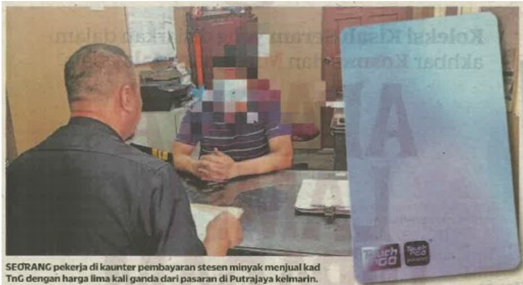
SEORANG pekerja di kaunter pembayaran stesen minyak menjual kad TnG dengan harga lima kali ganda dari pasaran di Putrajaya kelmarin.

Pekerja kaunter ambil kesempatan jual harga mahal