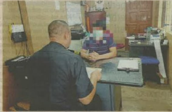
Penguat kuasa KPDNHEP melakukan pemeriksaan di seluruh negara berhubung aduan penjualan kad NFC TnG pada harga berlipat ganda.