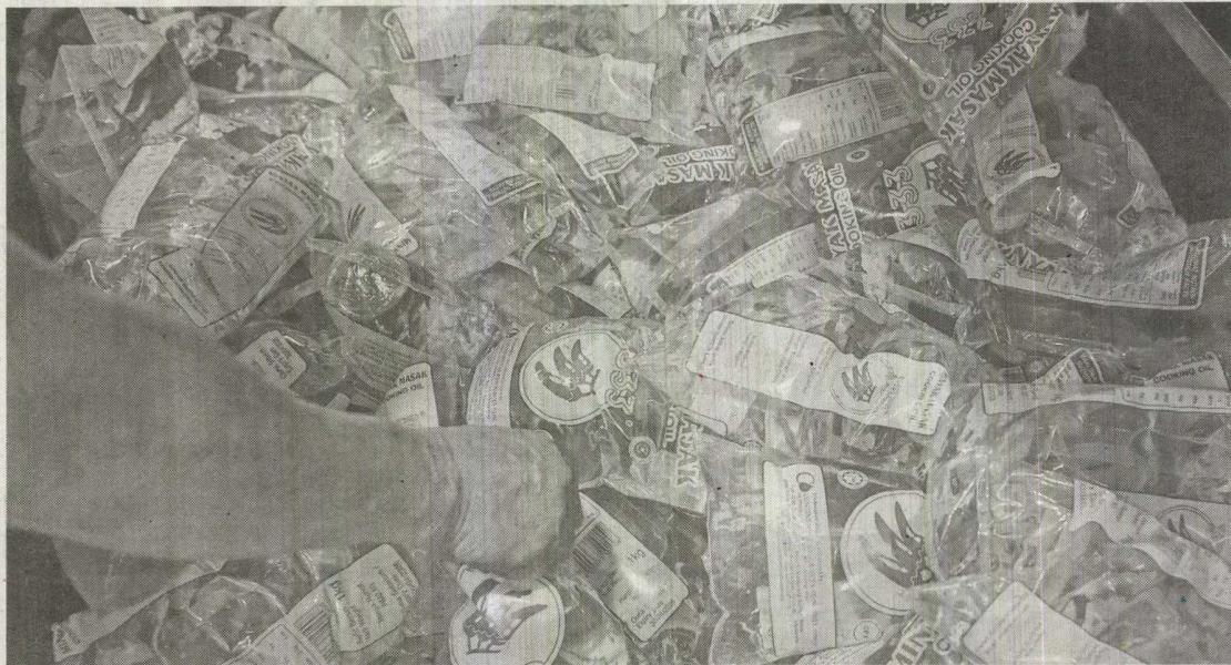
MINYAK masak paket barang kawalan bersubsidi. • Foto BERNAMA