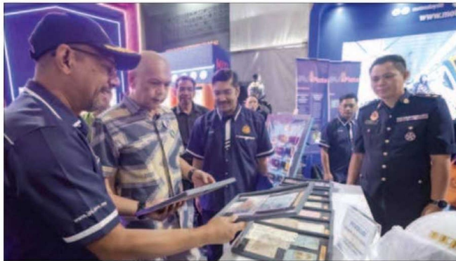
ARMIZAN melakukan reruai yang terdapat pada Program Madani Rakyat 2024 Sayangi Sabah di pekarangan Stadium Likas. Ahad.

"Saya juga turun hari ini berjumpa pempamer, petugas dan pengunjung mendengar sendiri maklum balas daripada masyarakat kita. Selain jabatan serta agensi kerajaan juga dapat berinteraksi kerana maklum balas daripada masyarakat itu penting untuk kita tambah baik perkhid-