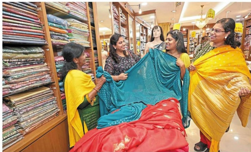
Bargain hunting: Shoppers looking at various saree designs while shopping at Little India in George Town. Consumer groups have pointed out that the prices of many items used for Deepavali have gone up tremendously.

"The financial pressure not only risks dampening the festive mood but may also limit participation in cultural practices and social gatherings, which are vital