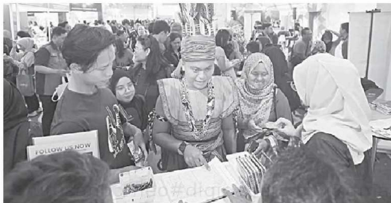
RAMAI PENGUNJUNG: Orang ramai mengunjungi reruai yang diadakan sempena Program MADANI Rakyat 2024 Sayangi Sabah di pekarangan Stadium Likas, Kota Kinabalu, semalam.

"Saya juga turun hari ini berjumpa pempamer, petugas dan pengunjung mendengar sendiri maklum balas daripada masyarakat kita. Selain jabatan serta agensi kerajaan juga dapat berinteraksi kerana maklum